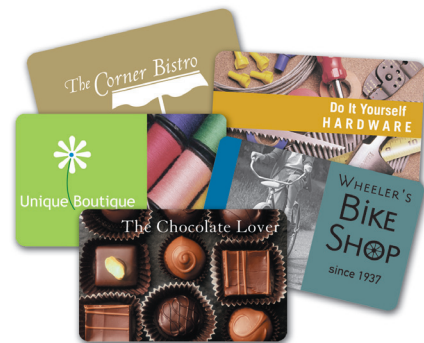
Custom Cards Samples