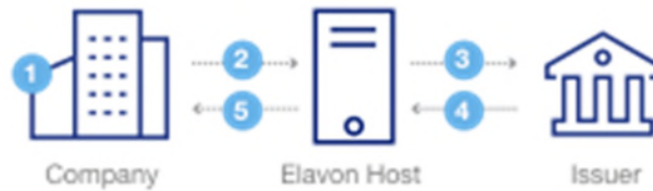
Figure 2-1. Authorization Process

The following diagram describes the electronic authorization process: